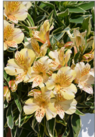
Colorita Fabiana Alstroemeria flowers

This is a relatively low maintenance plant. Trim off the flower heads after they fade and die to encourage more blooms late into the season. It is a good choice for attracting bees, butterflies and hummingbirds to your yard. It has no significant negative characteristics.