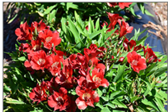
Colorita Kate Alstroemeria in bloom