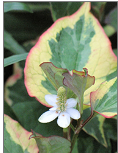
Chameleon Houttuynia flowers