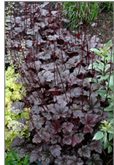
Plum Pudding Coral Bells in bloom