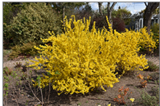
Magical Gold Forsythia in bloom