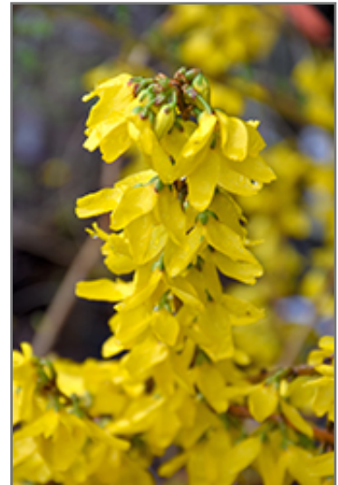
Magical Gold Forsythia flowers

* This is a 'special order' plant - contact store for details