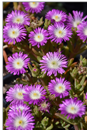
Wheels of Wonder Violet Wonder Ice Plant flowers