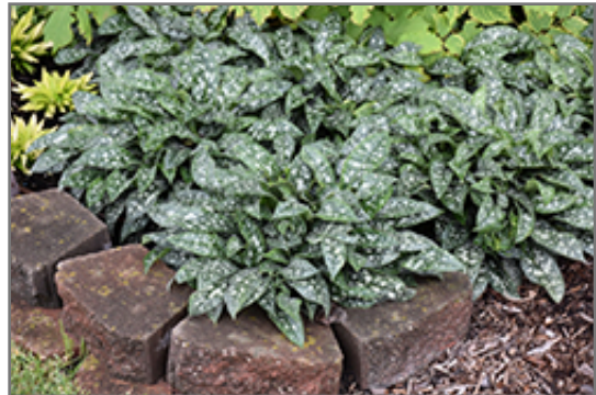
Twinkle Toes Lungwort

Twinkle Toes Lungwort will grow to be about 12 inches tall at maturity, with a spread of 18 inches. When grown in masses or used as a bedding plant, individual plants should be spaced approximately 15 inches apart. Its foliage tends to remain dense right to the ground, not requiring facer plants in front. It grows at a medium rate, and under ideal conditions can be expected to live for approximately 10 years. As an herbaceous perennial, this plant will usually die back to the crown each winter, and will regrow from the base each spring. Be careful not to disturb the crown in late winter when it may not be readily seen!