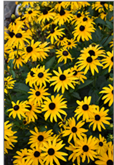
American Gold Rush Coneflower flowers

American Gold Rush Coneflower is an herbaceous perennial with an upright spreading habit of growth. Its medium texture blends into the garden, but can always be balanced by a couple of finer or coarser plants for an effective composition.