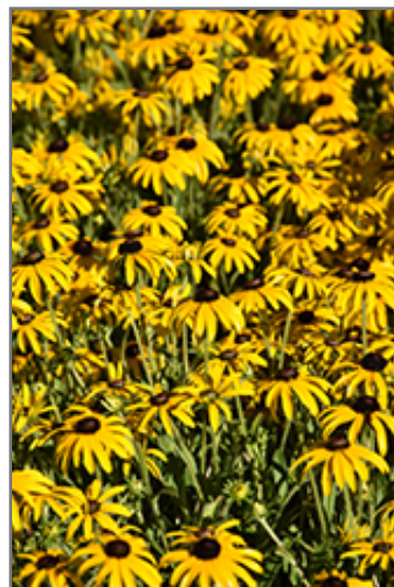
American Gold Rush Coneflower flowers

* This is a 'special order' plant - contact store for details