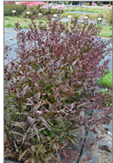
Pocahontas Beard Tongue

Pocahontas Beard Tongue is an herbaceous perennial with an upright spreading habit of growth. Its medium texture blends into the garden, but can always be balanced by a couple of finer or coarser plants for an effective composition.