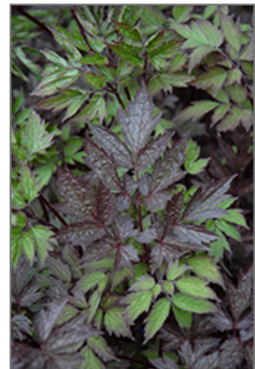
Black Negligee Bugbane foliage