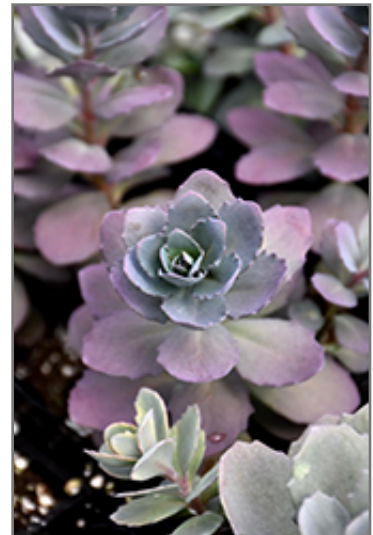
Plum Dazzled Stonecrop foliage