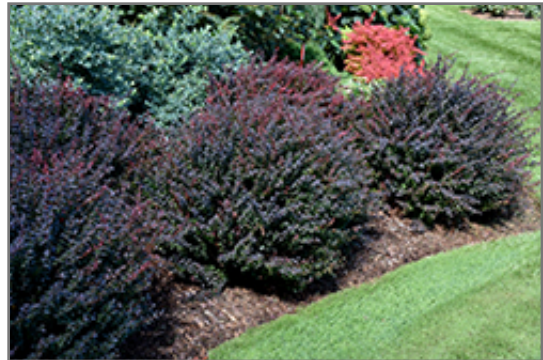
Sunjoy Mini Maroon Japanese Barberry