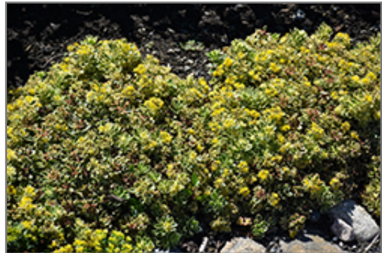
Rock 'N Low Boogie Woogie Stonecrop in bloom