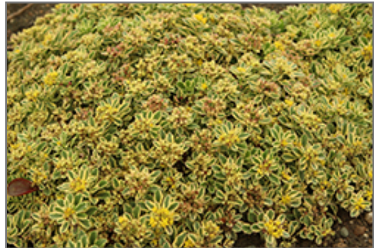
Rock 'N Low Boogie Woogie Stonecrop flowers

Rock 'N Low Boogie Woogie Stonecrop is a dense herbaceous perennial with a mounded form. Its medium texture blends into the garden, but can always be balanced by a couple of finer or coarser plants for an effective composition.