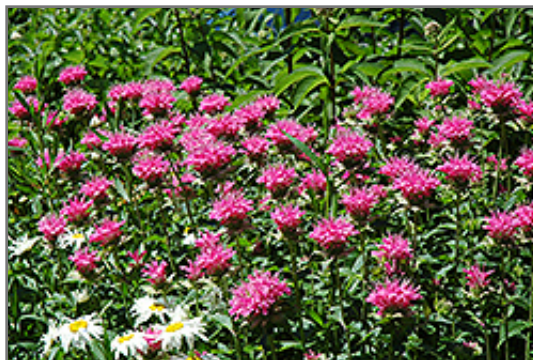
Marshall's Delight Beebalm flowers