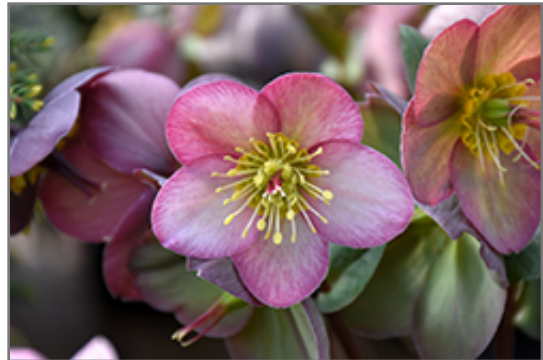
FrostKiss Cheryl's Shine Hellebore flowers

FrostKiss Cheryl's Shine Hellebore is an herbaceous evergreen perennial with an upright spreading habit of growth. Its medium texture blends into the garden, but can always be balanced by a couple of finer or coarser plants for an effective composition.