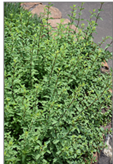
Hopley's Oregano