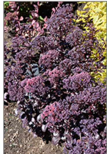
Dark Magic Stonecrop in bloom