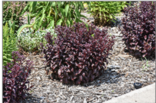
Dark Magic Stonecrop in bloom