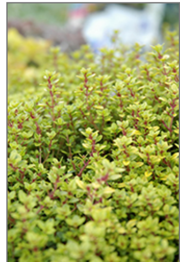
Archer's Gold Thyme flowers