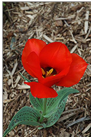
Casa Grande Tulip flowers