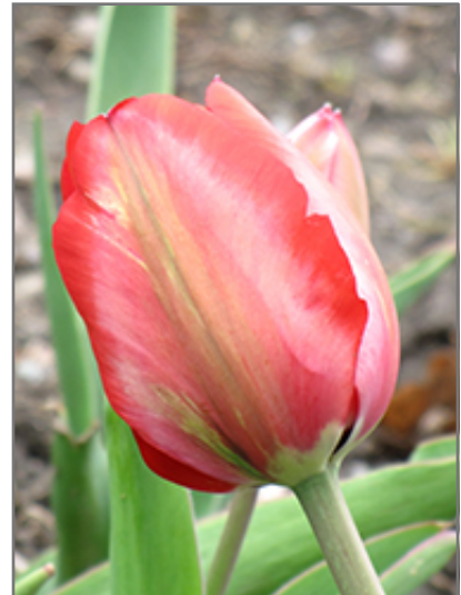
Menton Tulip flowers