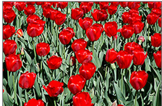
Parade Tulip flowers