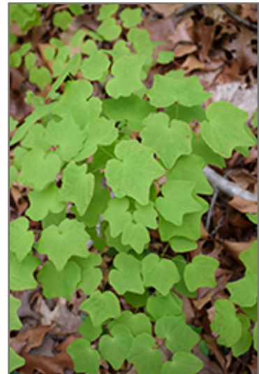
White Inside-Out Flower