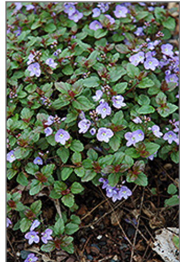
Waterperry Blue Speedwell in bloom

Waterperry Blue Speedwell is recommended for the following landscape applications;