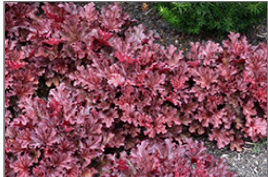
Ruby Tuesday Coral Bells

Ruby Tuesday Coral Bells is a dense herbaceous evergreen perennial with tall flower stalks held atop a low mound of foliage. Its medium texture blends into the garden, but can always be balanced by a couple of finer or coarser plants for an effective composition.