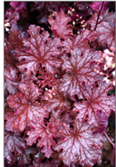
Ruby Tuesday Coral Bells foliage

* This is a 'special order' plant - contact store for details