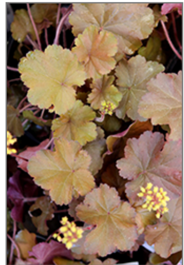
Sirens' Song Orange Delight Coral Bells foliage