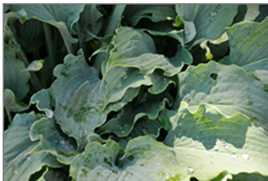
Wind Beneath My Wings Hosta foliage