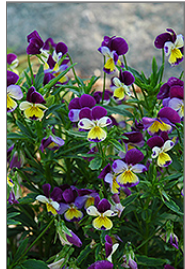
Johnny Jump-Up flowers

Johnny Jump-Up is recommended for the following landscape applications;