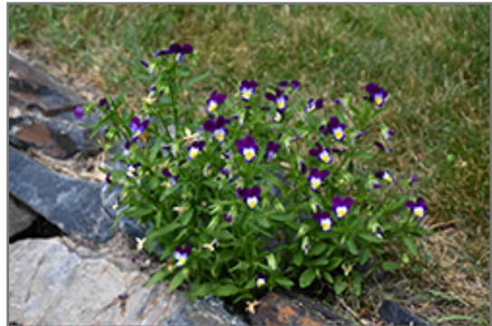
Johnny Jump-Up in bloom

Johnny Jump-Up will grow to be only 4 inches tall at maturity extending to 6 inches tall with the flowers, with a spread of 6 inches. When grown in masses or used as a bedding plant, individual plants should be spaced approximately 5 inches apart. It grows at a fast rate, and tends to be biennial, meaning that it puts on vegetative growth the first year, flowers the second, and then dies. However, this species tends to self-seed and will thereby endure for years in the garden if allowed. As an herbaceous perennial, this plant will usually die back to the crown each winter, and will regrow from the base each spring. Be careful not to disturb the crown in late winter when it may not be readily seen!