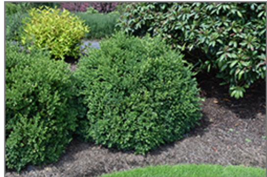
Green Velvet Boxwood

Green Velvet Boxwood is recommended for the following landscape applications;