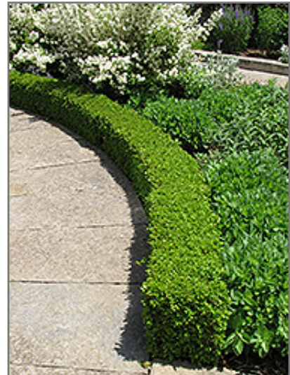
Green Velvet Boxwood

* This is a 'special order' plant - contact store for details