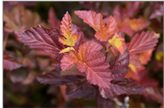
Center Glow Ninebark foliage

This shrub will require occasional maintenance and upkeep, and can be pruned at anytime. It has no significant negative characteristics.