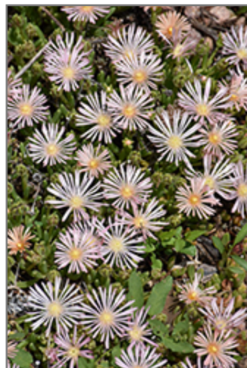
Alan's Apricot Ice Plant flowers

Alan's Apricot Ice Plant is recommended for the following landscape applications;