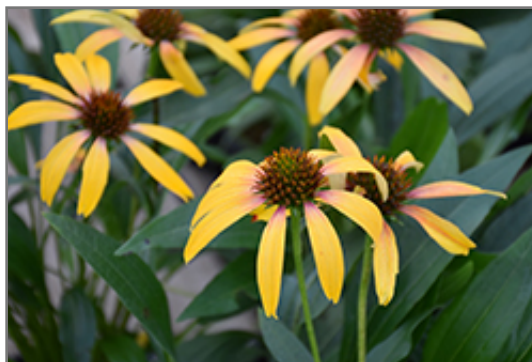
Fiery Meadow Mama Coneflower flowers

Fiery Meadow Mama Coneflower is recommended for the following landscape applications;