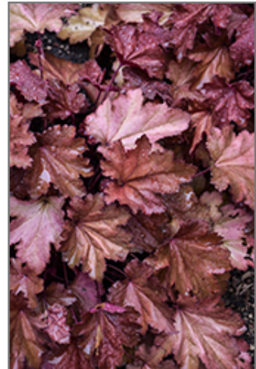
Magma Coral Bells foliage

Magma Coral Bells is recommended for the following landscape applications;