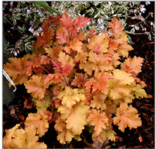
Marmalade Coral Bells foliage

Marmalade Coral Bells will grow to be about 8 inches tall at maturity extending to 18 inches tall with the flowers, with a spread of 16 inches. When grown in masses or used as a bedding plant, individual plants should be spaced approximately 14 inches apart. Its foliage tends to remain low and dense right to the ground. It grows at a medium rate, and under ideal conditions can be expected to live for approximately 10 years. As an evergreen perennial, this plant will typically keep its form and foliage year-round.