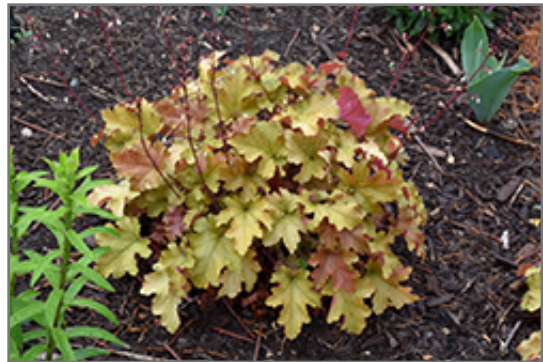
Marmalade Coral Bells