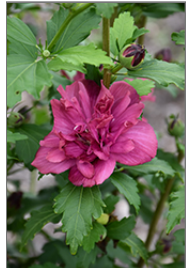
Collie Mullens Rose Of Sharon flowers

Collie Mullens Rose Of Sharon is a multi-stemmed deciduous shrub with an upright spreading habit of growth. Its average texture blends into the landscape, but can be balanced by one or two finer or coarser trees or shrubs for an effective composition.