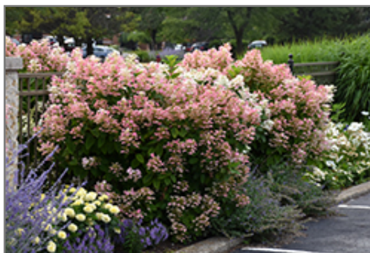
Quick Fire Hydrangea in bloom