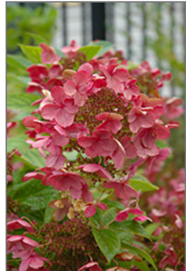
Quick Fire Hydrangea flowers (faded)

This shrub performs well in both full sun and full shade. It prefers to grow in average to moist conditions, and shouldn't be allowed to dry out. It is not particular as to soil type or pH. It is highly tolerant of urban pollution and will even thrive in inner city environments. Consider applying a thick mulch around the root zone in winter to protect it in exposed locations or colder microclimates. This is a selected variety of a species not originally from North America.