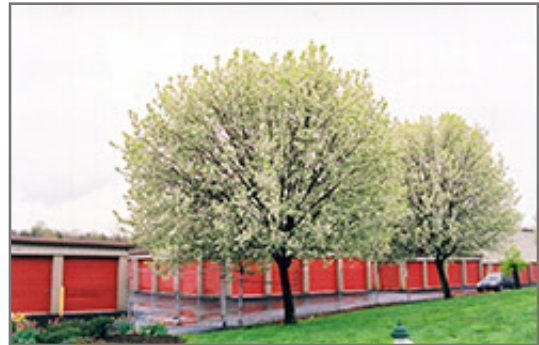
Bradford Ornamental Pear in bloom