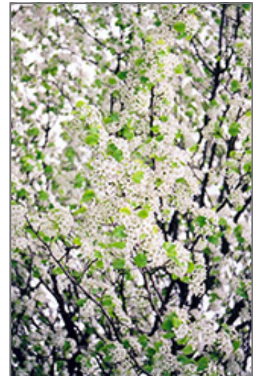
Bradford Ornamental Pear flowers