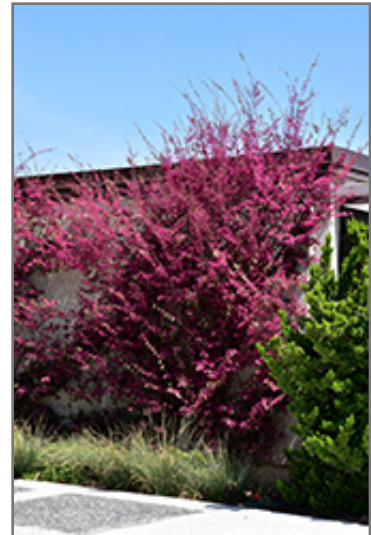
Red-Flowered Chinese Fringeflower in bloom

* This is a 'special order' plant - contact store for details