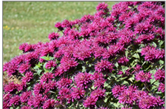
Grand Marshall Beebalm flowers