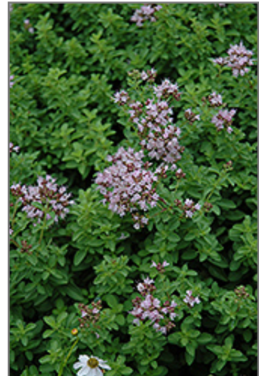
Dwarf Oregano flowers

Aside from its primary use as an edible, Dwarf Oregano is suitable for the following landscape applications;