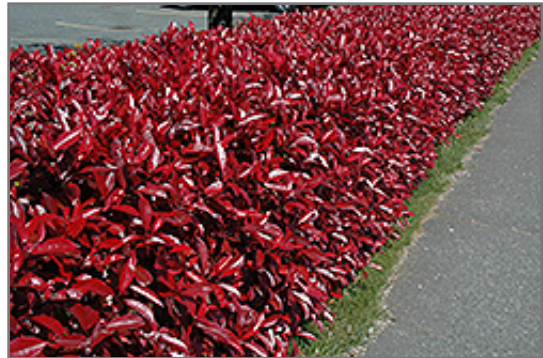
Fraser Photinia

Fraser Photinia will grow to be about 12 feet tall at maturity, with a spread of 7 feet. It tends to be a little leggy, with a typical clearance of 1 foot from the ground, and is suitable for planting under power lines. It grows at a fast rate, and under ideal conditions can be expected to live for 40 years or more.