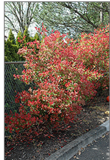
Fraser Photinia in bloom