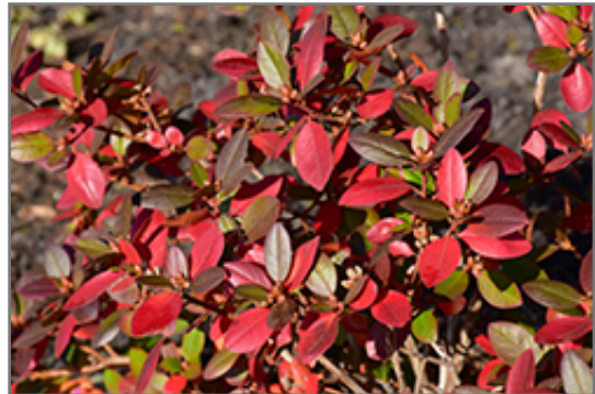
P.J.M. Rhododendron in fall

P.J.M. Rhododendron will grow to be about 5 feet tall at maturity, with a spread of 5 feet. It tends to be a little leggy, with a typical clearance of 1 foot from the ground, and is suitable for planting under power lines. It grows at a slow rate, and under ideal conditions can be expected to live for 40 years or more.