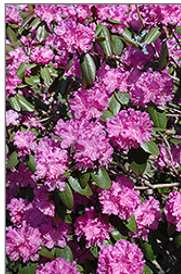
P.J.M. Rhododendron flowers