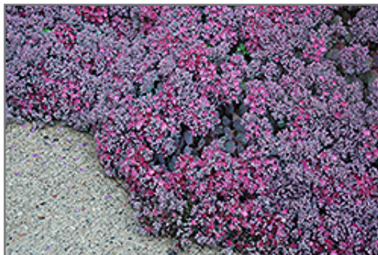
Lidakense Stonecrop in bloom