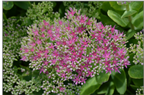
Neon Stonecrop flower buds