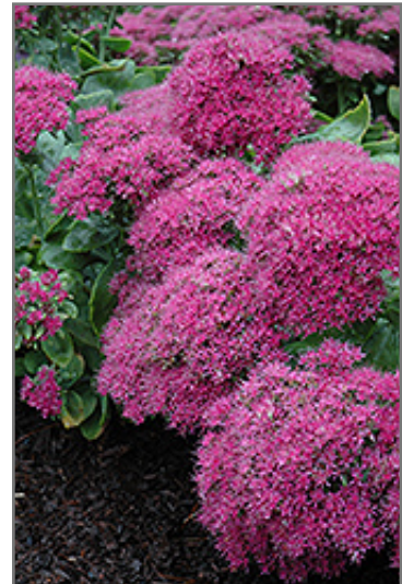
Neon Stonecrop flowers

Neon Stonecrop is a dense herbaceous perennial with an upright spreading habit of growth. Its relatively coarse texture can be used to stand it apart from other garden plants with finer foliage.