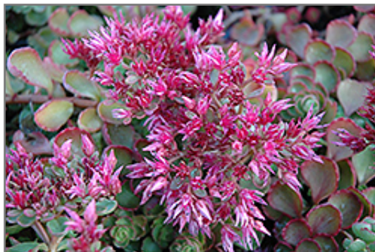
Fulda Glow Stonecrop flowers