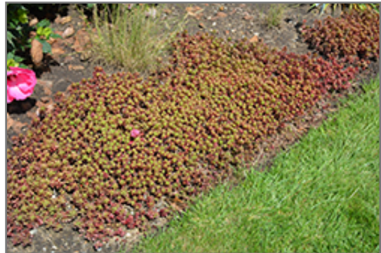
Fulda Glow Stonecrop