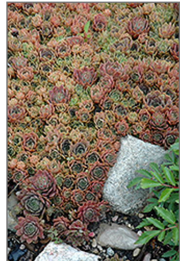
Silverine Hens And Chicks