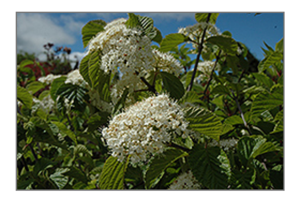
Cardinal Candy Viburnum flowers