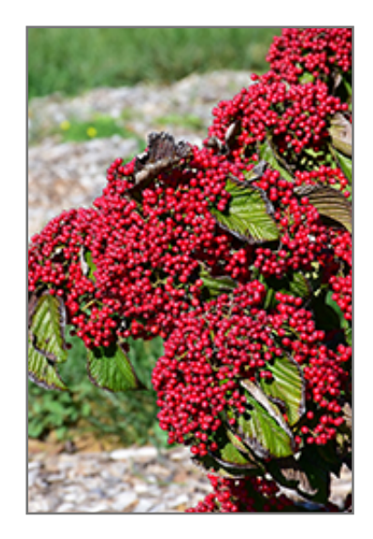
Cardinal Candy Viburnum fruit

Cardinal Candy Viburnum is a dense multi-stemmed deciduous shrub with a more or less rounded form. Its average texture blends into the landscape, but can be balanced by one or two finer or coarser trees or shrubs for an effective composition.