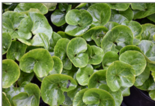
European Wild Ginger foliage