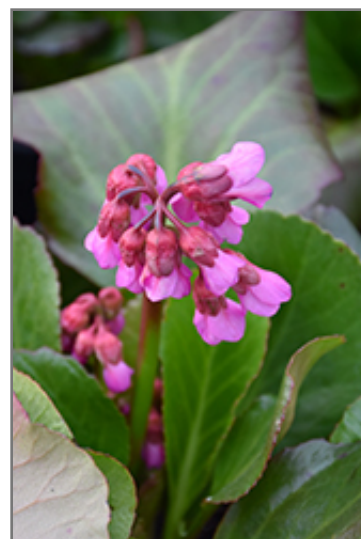
Bressingham Ruby Bergenia flowers

Bressingham Ruby Bergenia is recommended for the following landscape applications;