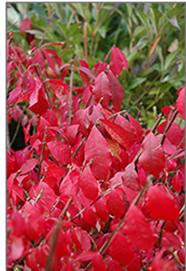
Burning Bush (tree form) in fall