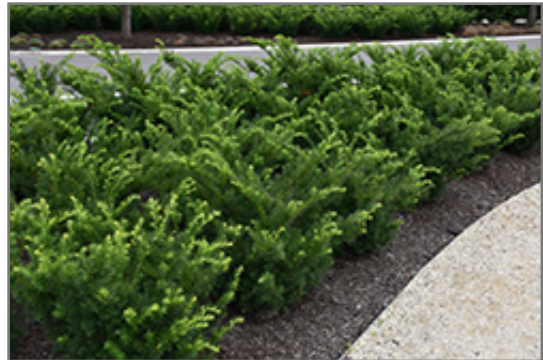
Densiformis Yew

Densiformis Yew is recommended for the following landscape applications;